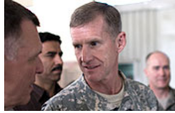
Photos: On the Ground with the Runaway General