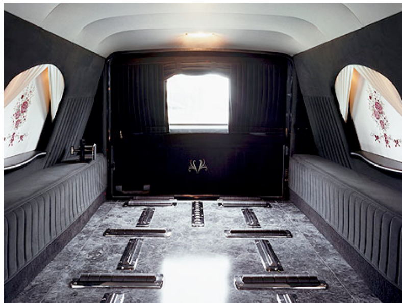
The inside of the hearse from the Collins Funeral Home.

After a few minutes — there is no protocol for this, only feel — he signaled the honor guard that it was time to march forward and lift the casket to their waists again, and to carry it to the back of the hearse.