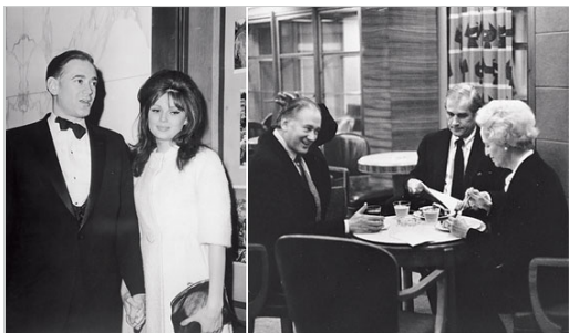
From left: Felker with his second wife, Pamela Tiffin,

I don’t think I can adequately convey the pride he took in this discovery. He had developed night vision for detecting new styles of life. “Style of life”— Lebensstil in German—was a term invented a hundred years ago by the German sociologist Max Weber, the father of status theory itself. All new styles of life, he said, were created by “status groups,” like-minded souls who try to create spheres of their own, insulated from the opinions of people outside. The socialites of the Saturday route had their style of life in the 1960s ... and hippies had theirs. It was not until the late 1950s that the terms themselves, “status,” referring to social position, and “style of life,” referring to the manners and mores of status groups, emerged from academic sociology and became part of everyday language.